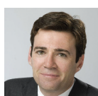
Andy Burnham Mayor, Greater Manchester

We'll be networking before, during, and after the dinner, including drinks in the historic Worsley Old Hall.